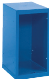
PRIMARY JR. CUBBIE