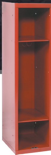
PRIMARY II CUBBIE